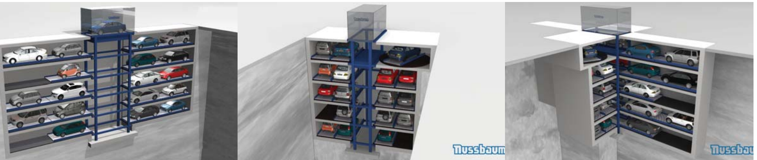
SMART PARKER MAX-X (lengthwise conveyor)