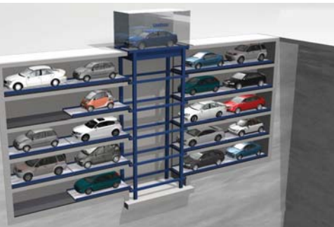
SMART PARKER MAX-X (lengthwise conveyor)

The NUSSBAUM SMART PARKER MAX serves full automatically parking of vehicles – underground – on several parking levels. At the ground floor the vehicles went to palettes in the transfer station and get transported full automatically to the underground parking levels with a vertical conveyor. The structure for picking up the palettes is built by a steel or cement construction. The arrangement of the palettes can be realized in different ways, according to the local conditions also with several transfer stations. The integrated turn table turn the vehicles in the right exit position and allows faster access times.