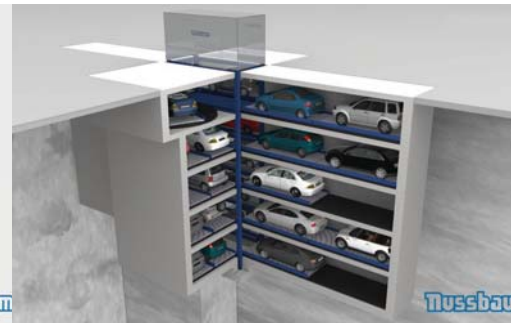
SMART PARKER MAX-XY (lengthwise and cross conveyor)