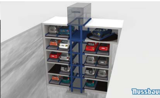
SMART PARKER MAX-Y (cross conveyor)