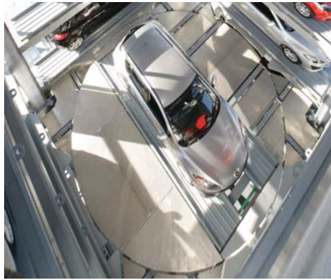
Vertical conveyor system with turntable